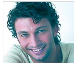
German tenor Jonas Kaufmann