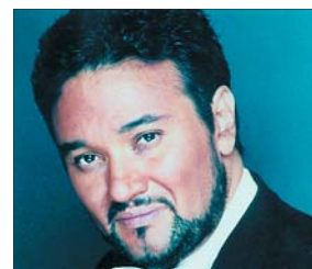
Mexican tenor Ramon Vargas