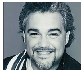
Swiss-Italian tenor Salvatore Licitra