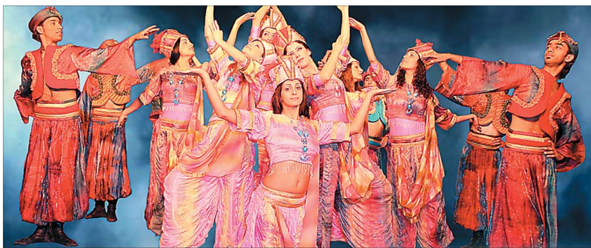
Gala of Africa, a showcase of the continent's rich heritage, will be staged at the Great Hall of the People tonight.