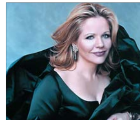
American soprano Renee Fleming

This trio of tenors will perform solos, duets and trios, while Licitra has even prepared a special Chinese song for his Beijing concert.